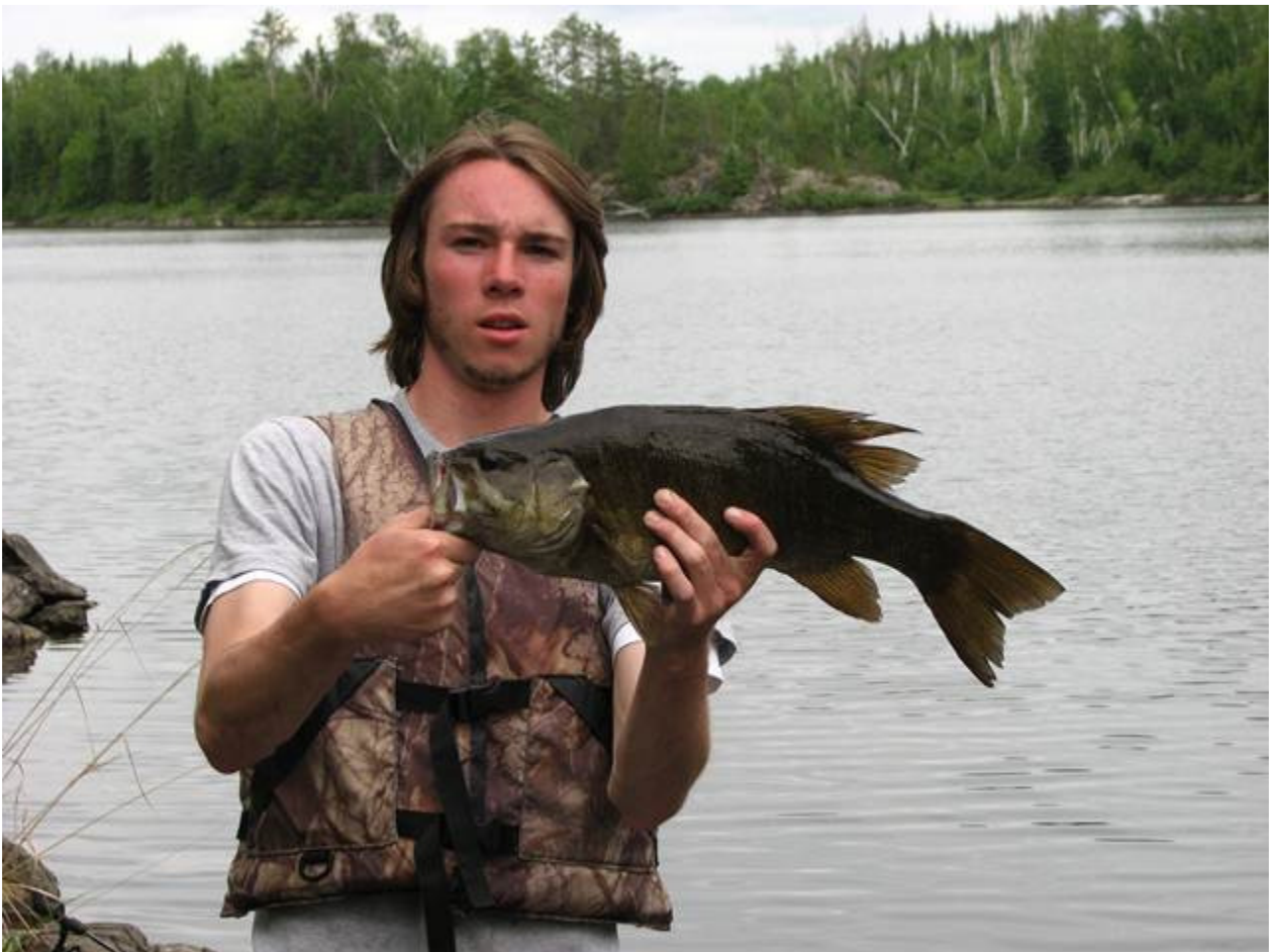
This small mouth bass was caught at the entrance to Splash Lake.

And then the fish just kept coming and coming.