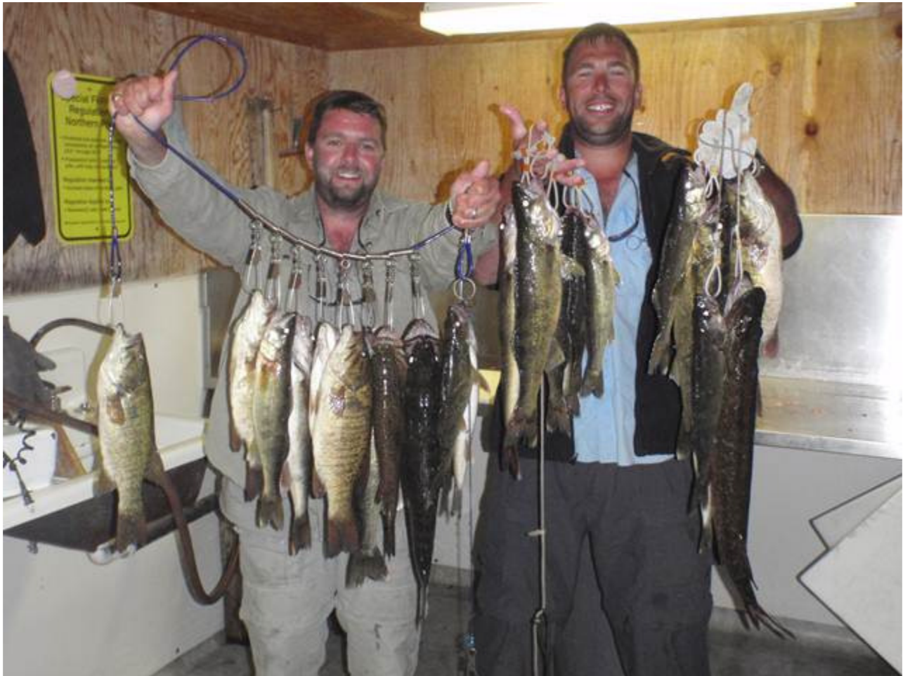
The location for these was a secret.